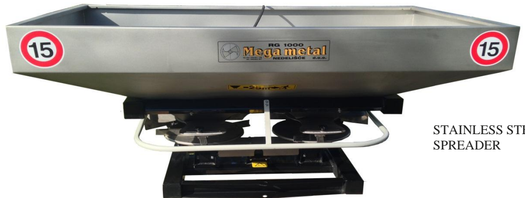
STAINLESS STEEL SPREADER